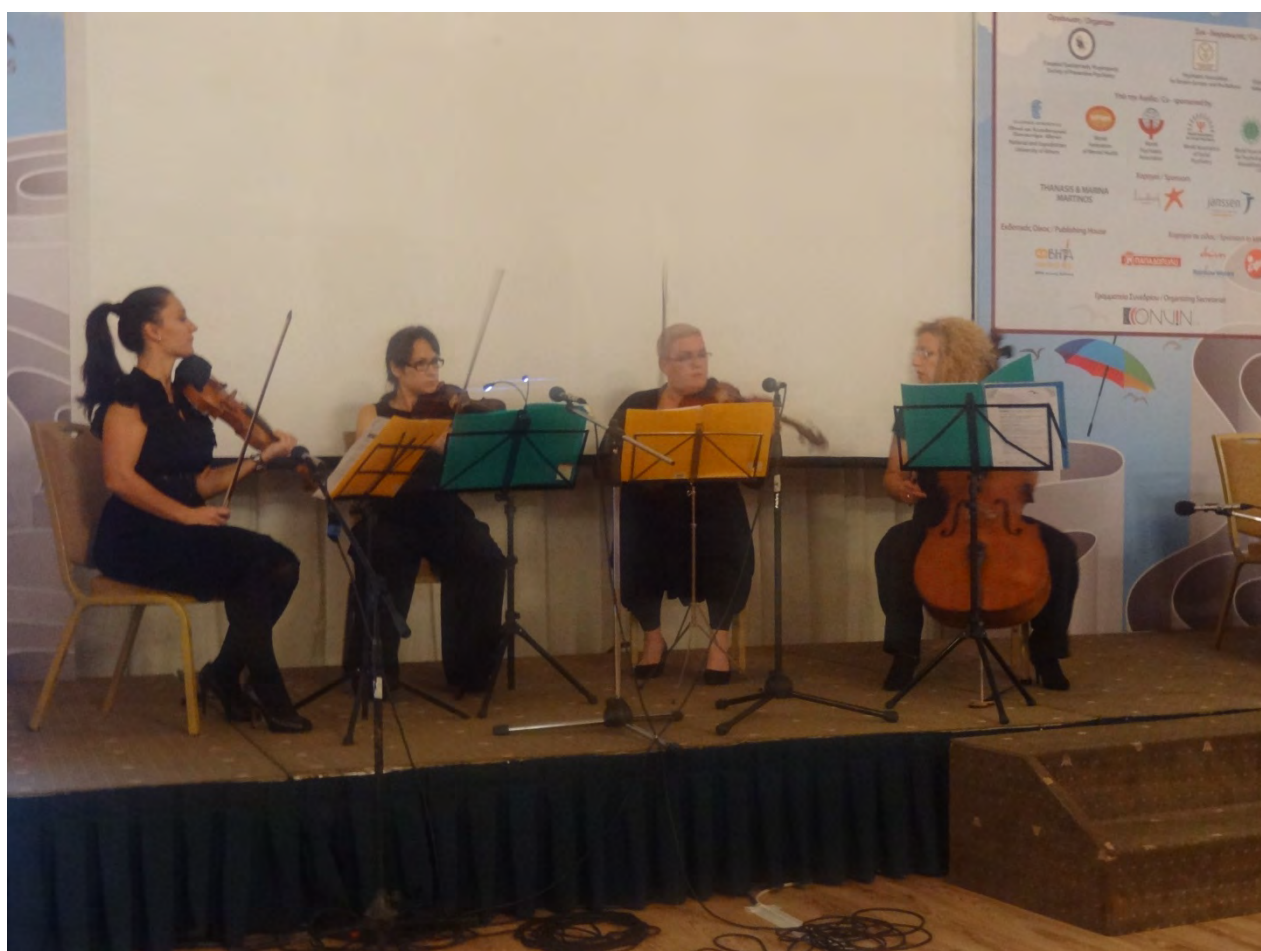
The musical Ensemble of the Municipality of Athens