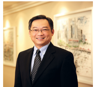
Singapore's Health Minister Gan Kim Yong.

Innovations in Mental Health Care through Holistic Interventions in the Asia Pacific Region