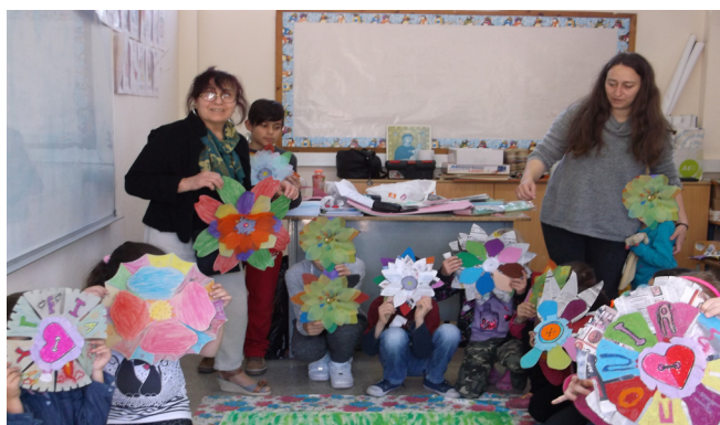
Children and instructors at one of the art classes

Each year the Advocacy Group for the Mentally Ill (A.G.M.I.) generates advance publicity for World Mental Health Day by organizing an event months ahead of it. This year the event focused on the creation of mixed media art work by students at the Open School of Larnaca Municipality, working with three art instructors over a period of several weeks. The students were encouraged to express their feelings about “Dignity in Mental Health” and to consider how their art could promote advocacy for mental health.