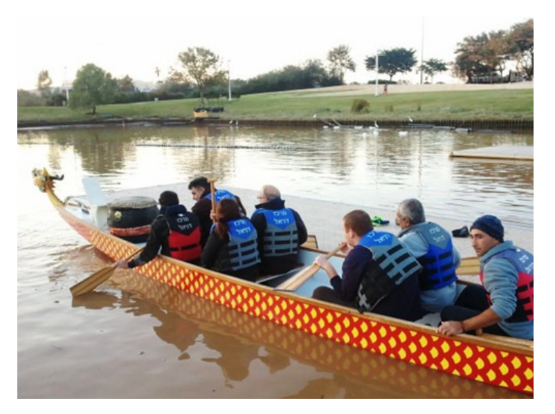
Above: Mind and Fitness—Rowing a Dragon Boat

Mental health patients live 25-30 years less than the general population. Excess weight, smoking and diabetes are 1.5 – 3.0 times higher among schizophrenia pa-