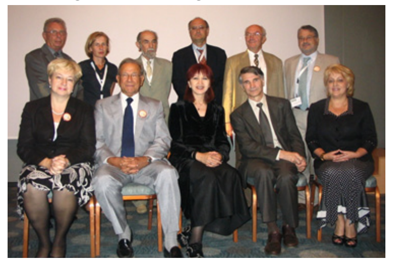
Above: The officers of the Association

The PAEEB produced the Thessaloniki Declaration on 20th September 2007 in support of the need to promote scientific knowledge in Eastern Europe and has also co-signed the Athens Declaration on Disasters (2013) and on "Living with Schizophrenia" (2014).